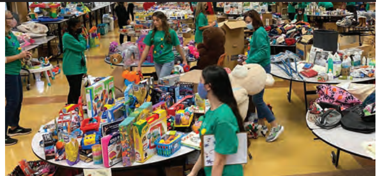
Holiday Food and Coat Distribution

📌 Holiday Food and Coat Drive/Distribution: This event combines the work of the York County Food Bank (YCFB) and the YS community.