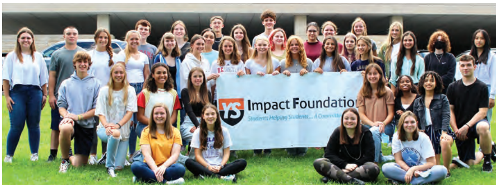
YSEF IF student members, 2021–2022 School Year

1800 Hollywood Drive York PA, 17403 717.885.1160 www.ysef.org